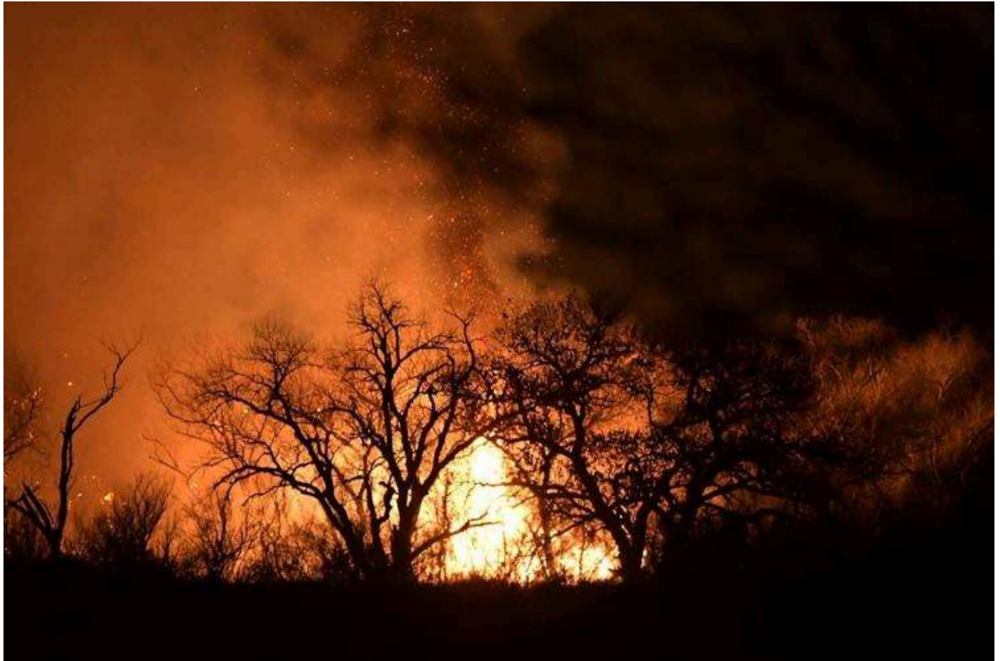
The Unified Fire on Tuesday. The blaze has grown to 500 acres but an evacuation order has been lifted.

This comes as the National Weather Service sounds the alarm about a significant fire weather pattern developing. The dry fuel brought by worsening drought conditions and historically low snowpack levels means lightning strikes from storms could ignite new fires